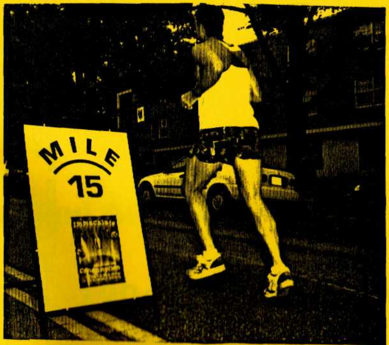
A welcome site during the race marked only a half mile to go (and no more hill).